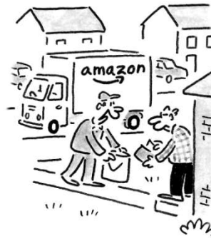
'Jeff Bezos is standing down so we're having a whip-round for him'