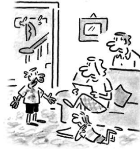
'Yes, I've eaten all the Easter eggs, but there's a war going on and we should focus on the bigger picture'