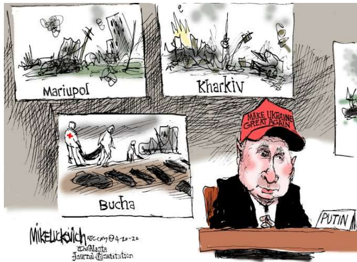
Mike Uckvich NYC com 04-12-22 The Atlantic Journal of Constitution