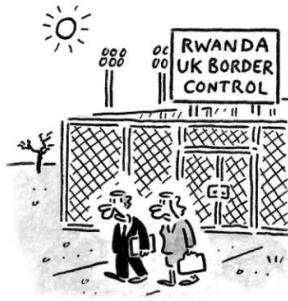
'And if this goes well we plan to move all GP appointments here'