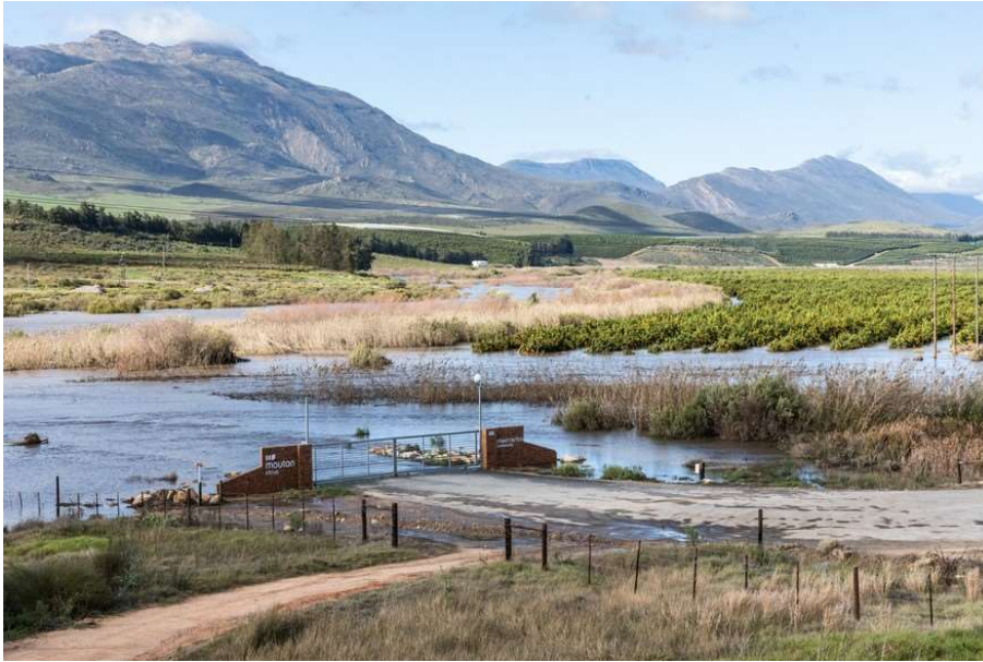
Olifants River in Flood above Citrusdal

a workable plan. He said if the situation worsens, they will “escalate” it. “We’re not there yet,” he said. The services of a SAAF helicopter have been requested.