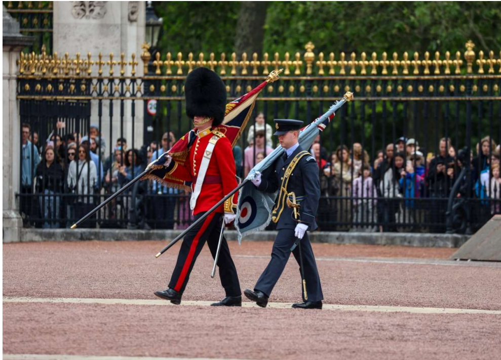
The Royal Air Force's King's Colour Squadron has taken on the responsibility as the King's Guard at the London Palaces 80 years after first conducting the duty.

The ceremony to assume the prestigious duty, known as the Changing of the Guard, took place on the forecourt of Buckingham Palace and saw the King's Colour Squadron assume responsibility for the security of His Majesty's London residences – Buckingham Palace and St James' Palace. The day was made richer for the many spectators with music from the Central Band of the Royal Air Force. This year marks the 80th anniversary of the RAF Regiment's first King's Guard when in 1943 the Changing of the Guard, also referred to as the Mounting of the Guard or Guard Mounting, was conducted in front of King George VI. This most recent Guard Mounting is the first time the new King's Colour for the Royal Air Force has been paraded as part of the Changing of the Guard ceremony. The Colour, a light blue ensign made of silk, was presented by His Majesty in April this year having originally being presented in 1951 by the then Princess Elizabeth.