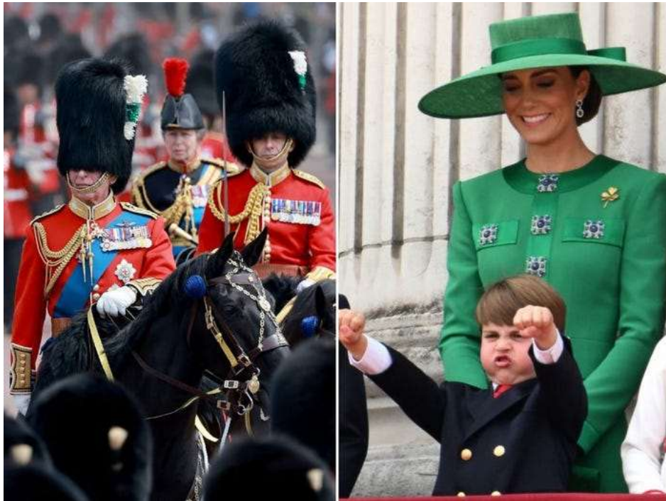
King Charles Trooping the Colour parade: The Princess of Wales and Prince Louis

fly-past at 1pm. The Trooping of the Colour has marked the official birthday of the British Sovereign for over 260 years. 2023 marks His Majesty King Charles III's first Trooping of the Colour as Sovereign. Over 1,400 parading soldiers, 200 horses and 400 musicians came together in a great display of military precision, horsemanship and fanfare to mark The King's official birthday. The parade moved from Buckingham Palace and down The Mall to Horse Guard's Parade, alongside Members of the Royal Family on horseback and in carriages. The display closed with an RAF fly-past of 70 aircraft, watched by Members of the Royal Family from Buckingham Palace balcony. After existing in various forms since the 17th century, the Trooping the Colour ceremony has been held every year in London to mark the sovereign's official birthday since the accession of King George IV in 1820, except during the world wars and a national strike in 1955. Monarchs are traditionally given a second birthday if they were not born in the summer, in case the British weather is unsuitable for an outdoor event!