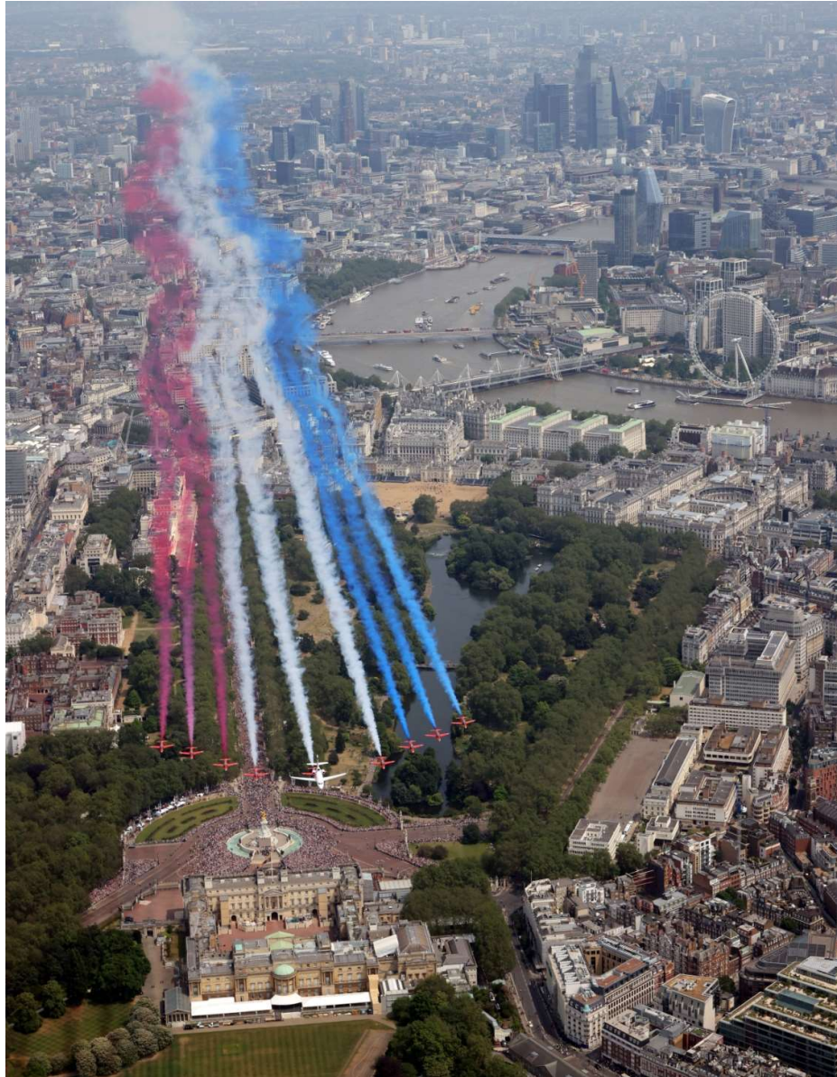
The Sovereign's birthday is officially celebrated by the ceremony.

In 2023, this impressive display of pageantry took place on Saturday 17th June by Regiments of the Household Division, on Horse Guards Parade, with His Majesty the King attending and taking the salute. His Majesty King Charles III holds the appointment of Colonel-in-Chief of the Regiments of Household Division. Each Regiment has a Colonel who is normally either a member of the Royal Family or a senior officer. The parade began at Buckingham Palace and travelled along The Mall to Horse Guards Parade. There, the monarch carried out an inspection of the troops, before leading the Guards in a parade back to Buckingham Palace. Once at the Palace, the monarch took the salute and 41-gun Salutes were fired in Green Park and at the Tower of London. Finally, they joined other members of the Royal Family on the palace balcony to watch the Royal Air Force