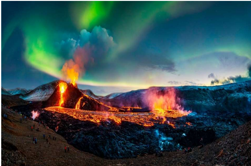
Earth, solar wind and fire: Northern lights and molten lava