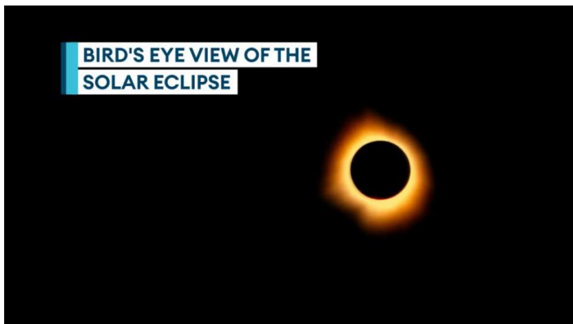
US military personnel from Little Rock Air Base filmed the total solar eclipse, visible in the US, last Monday during a training flight from the Arkansas base.