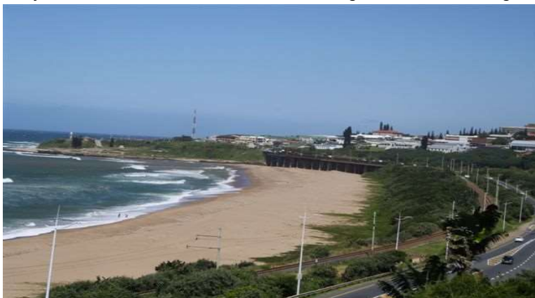
Today, showing old main road (R102) and the modern road and rail bridge across the river.