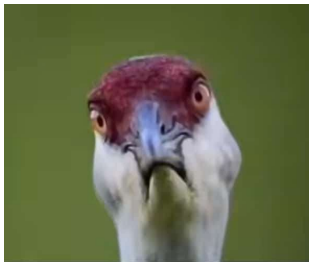
My wife's face when she's ready to leave the party and I open another beer.

It was only a matter of time, first hybrids then electric and now vegan.