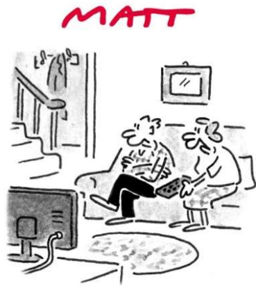
'Do you want to shout at politicians or footballers?'

officials for the region "withdrew the officers from Gwambe, stating they wouldn't endanger them further," he told CITEZW news.