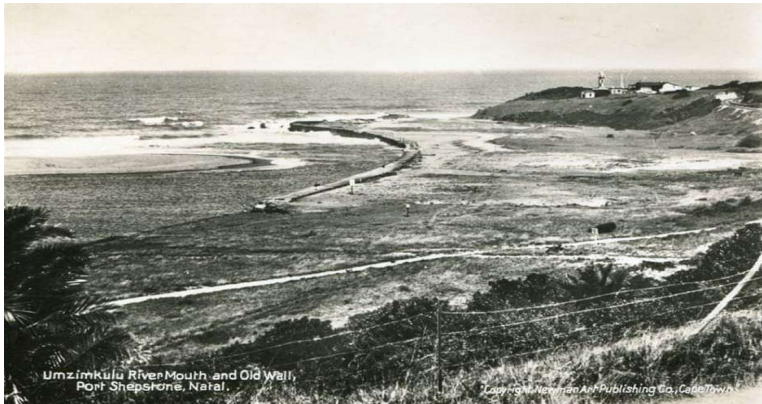
Early 1900s: Mzimkhulu River mouth showing old sea wall and lighthouse erected in 1905

Your scribe came across the picture of the Mzimkhulu river mouth at Port Shepstone as it was some time after the lighthouse was erected in 1905, and before the railway reached Port Shepstone in 1917, and added a recent photograph of what the scene looks like now.