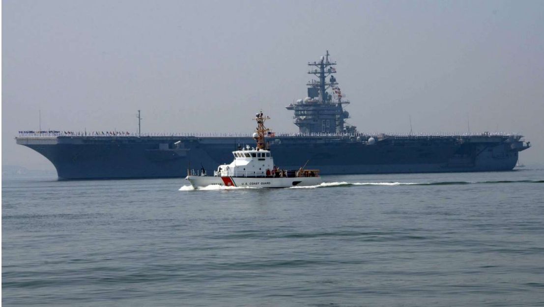
The aircraft carrier USS Dwight D. Eisenhower (CVN-69) and its associated strike group have defeated hundreds of incoming Houthi attacks in the Red Sea.

For DIU, medium sized refers to drones in “group three,” which are UAS as large as roughly 330 pounds. The sea service has been busy over the past eight months taking out unmanned aerial systems and missiles launched by the Houthis at vessels in the Red Sea, a major global shipping route. While the Navy has been highly successful in its recent air defense missions, Pentagon officials are concerned about the so-called “cost exchange ratio” where in some cases, multimillion-dollar missiles have been used to take out UAS that only cost a few thousand dollars to make. To help meet the increasing demand for counter-drone tools at a lower price point, the department is looking for new shipborne solutions. ( Breaking Defence )