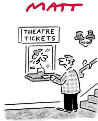
'Stalls? First slip, or second slip? Your job is to catch Sir Ian McKellen'

It was only a matter of time, first hybrids then electric and now vegan.