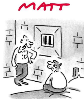
'Overcrowding forced Gareth Southgate out. There are nearly 55 million football experts in England'