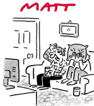
'I feel like I age ten years every time England play football. I hope President Biden isn't watching'

“Never argue with someone whose TV is bigger than their bookcase...” Emilia Clarke.