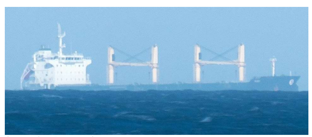
Shades of the "Lady R in Simonstown"...

Life in Margate (UK) continues as usual, despite the threat of a stranded ship loaded with 20,000 tons of explosive cargo nearby. The Ruby, a Maltese-flagged Russian cargo ship, is carrying twenty thousand tonnes of potentially explosive ammonium nitrate fertiliser after leaving Russia in July. A maritime explosion could happen.