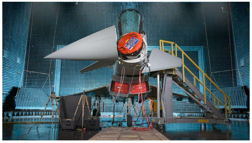
Typhoon with the ECRS radar before first flight.

A new advanced radar that will allow RAF pilots to locate, identify and suppress enemy air defences has flown for the first time. A prototype of the European Common Radar System Mark 2 (ECRS Mk2) was operated on a Typhoon at BAE Systems in Lancashire. As well as performing traditional functions, the ECRS Mk2 can provide advanced electronic warfare capabilities.