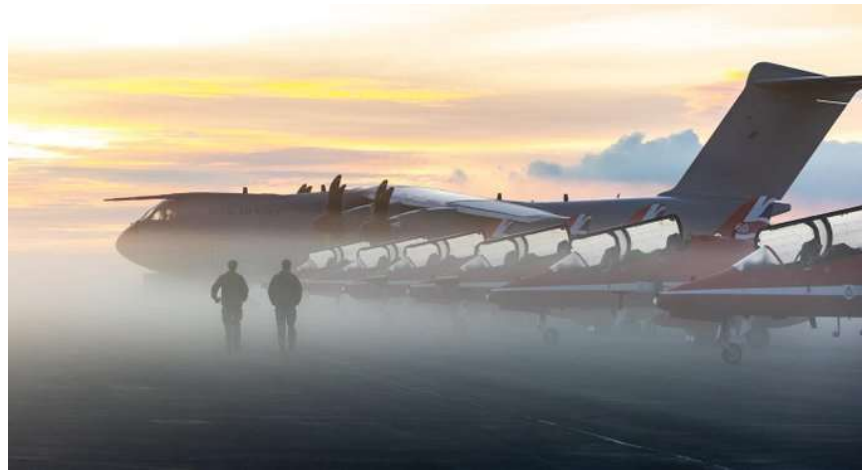
A Cold Start in Iceland as Maple Leaf Team Homeward Bound

The Red Arrows and their A400M Atlas support aircraft have been treated to a different type of air display - taking in the Northern Lights as they made their way home from their Maple Hawk tour in Canada. They left North America earlier this week and stopped in Iceland via a refueling stop in