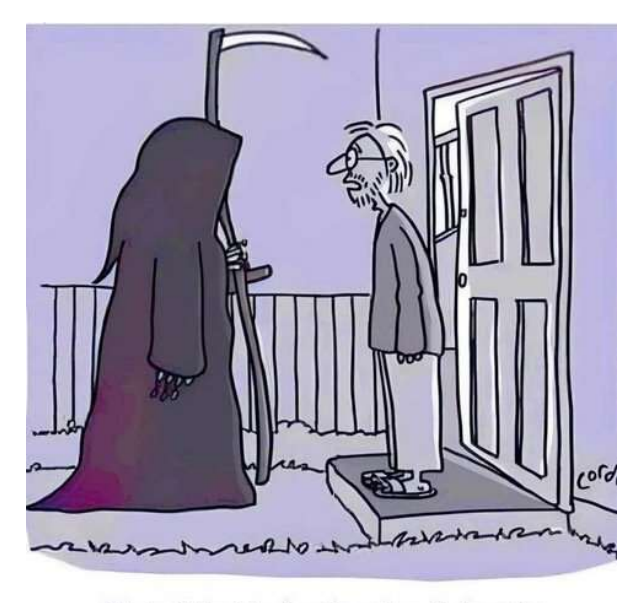
"But all the blueberries...the wholegrains... the skimmed milk...the decaffeinated coffee... the brocolli...you mean it's all been for nothing?"