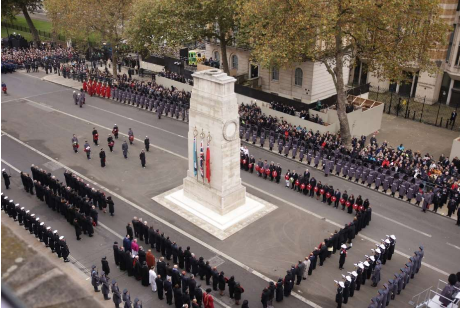
Approximately 10,000 members of the public lined Whitehall in London to take part in the annual two-minute silence at the Cenotaph and to watch The Royal British Legion's Veterans Parade.

Of the 10,000 individuals marching this year, 326 different Armed Forces and civilian organisations were represented. Among those marching are people of all ages from the bereaved children of Scotty's Little Soldiers through to the D-Day veterans of the Spirit of Normandy Trust. Minister for Veterans and People, Al Carns who completed his military service in May was on parade for the first time as part of the Royal Marines Association.