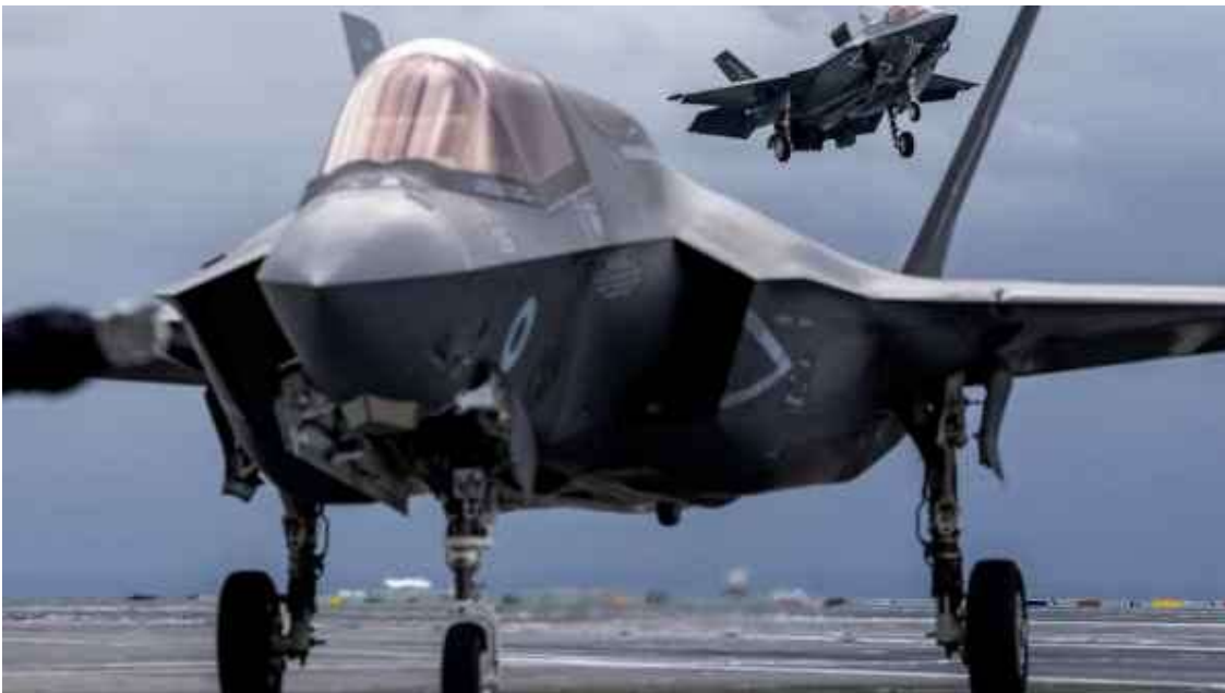
ACM Sir Rich Knighton said he had not known a more challenging strategic environment in his 35 years of service

"After a 30-year sabbatical, deterrence is back", with the service needing to move back to its Cold War role of being strategically capable, the head of the RAF has said. Giving the annual Trenchard Memorial lecture at the defence think tank Royal United Services Institute, Air Chief Marshal Sir Rich Knighton said he had not known a more challenging strategic environment in his 35 years of service. The Chief of the Air Staff said the Air Force had spent the last few decades optimising itself to fight less powerful adversaries or take on asymmetric threats. He told his audience the RAF must now change. "We need to become match fit for the new bigger and more important game... to deter a costly war we must build a credible force that foes fear and our allies value," Air Chief Marshal Sir Rich said. "We cannot do this alone, the RAF must evolve." Talking about the growing need to replace the UK's "ageing" ground-based radar system, he advocated switching to a "mobile, integrated and distributed sense and warn capability". "We should also remember the old dictum that the best form of defence is attack," he said. "Ukraine cannot put up a shield to protect themselves against the 30,000 glide bombs lobbed into the Kursk Oblast. "Instead, what they need – and what we would need – is the ability to strike the aircraft launching these bombs on the